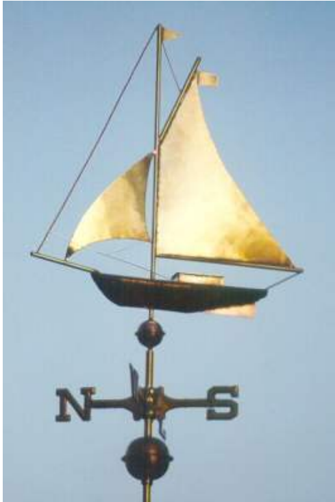
Sailboat Weathervane, traditional Sailboat