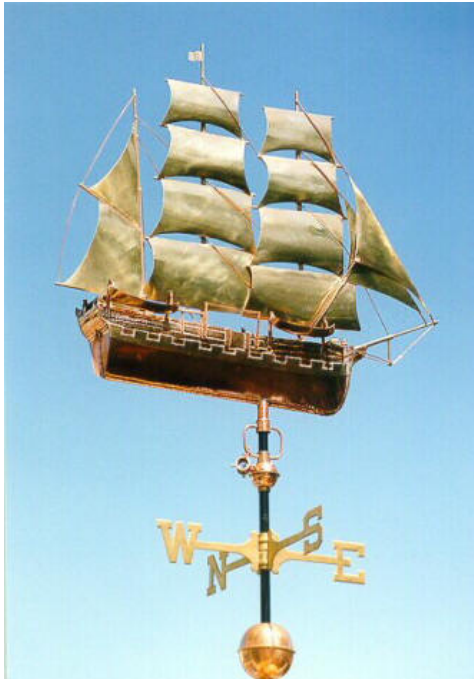
Sailboat Weathervane Charles Morgan Whaling Ship