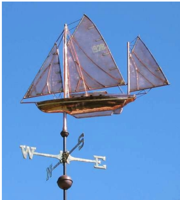
Sailboat Weathervane, Gaff Rigged Yawl