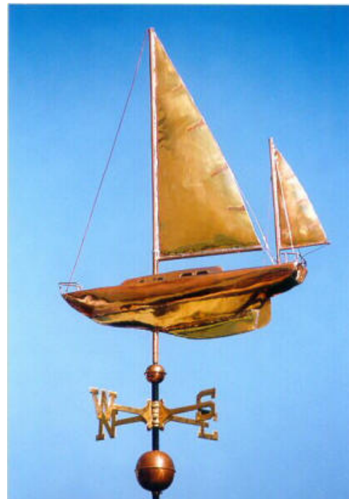
Sailboat Weathervane, Hinckley Yawl