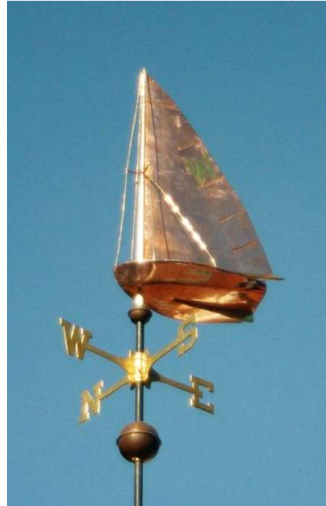
Sailboat Weathervane, A-Cat Sailboat