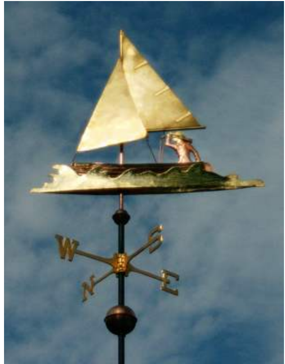
Sailboat Weathervane, Set of the Sail