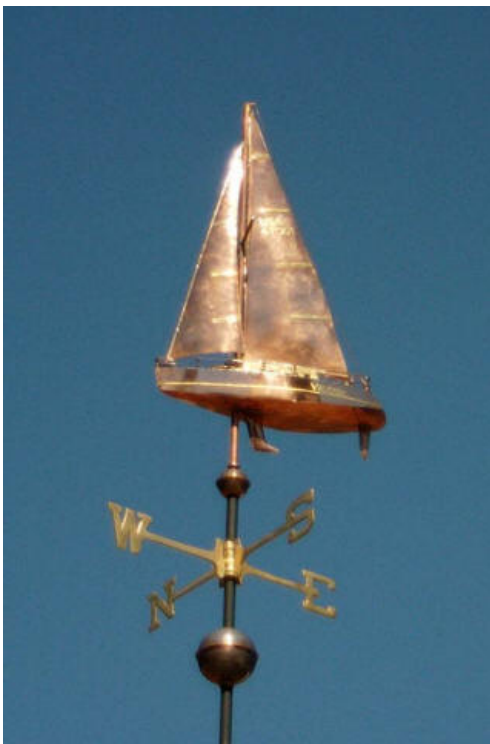
Sailboat Weathervane, Concordia 47 Sailboat