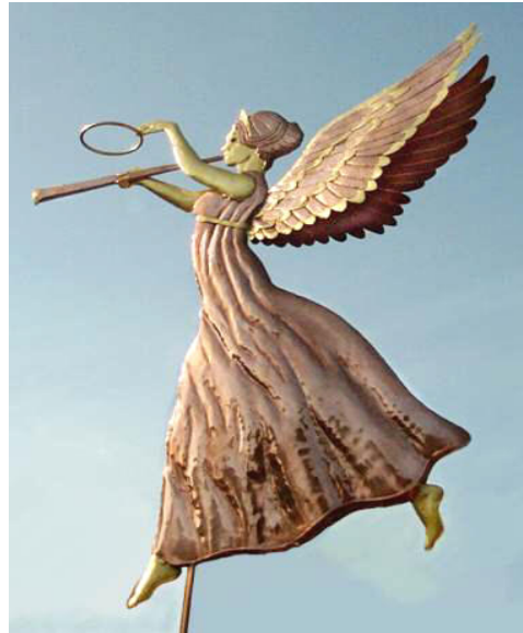
The Triumphant Angel Weathervane Design